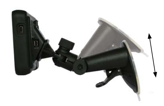
M-Nav 760 with adjustable docking bracket